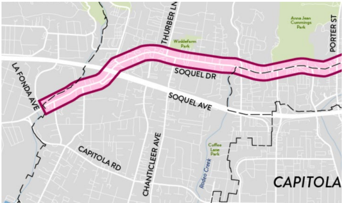
Western Project Area